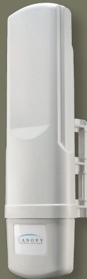
Subscriber Module (SM)